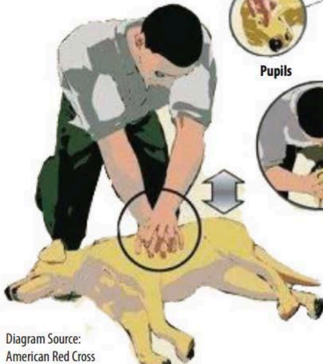
Diagram Source: American Red Cross